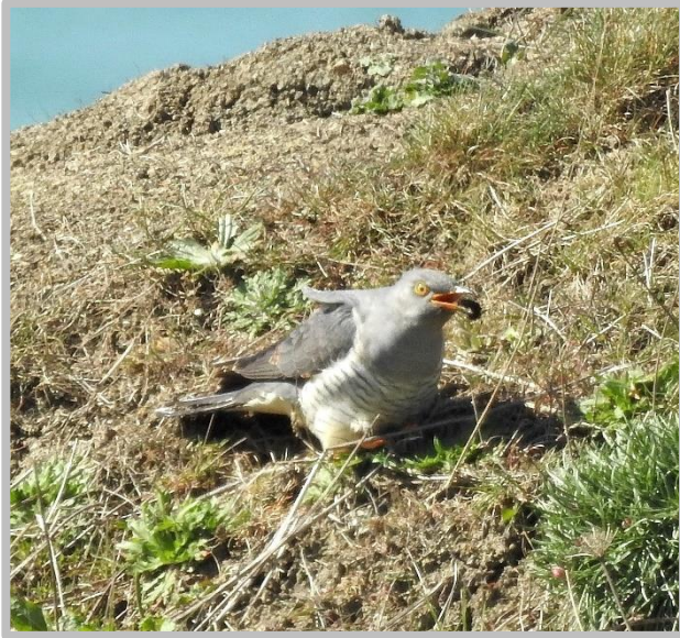
Cuckoo feeding on caterpillar

During April , we will be collecting records of Cuckoos .