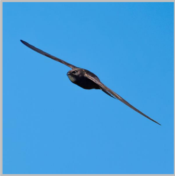
Swift

In May , we will be collecting records of Swifts .