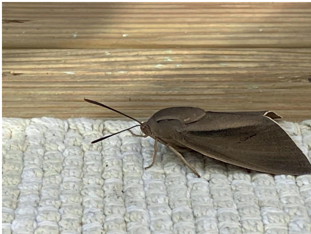
Fig. 2: Palm moth ( Paysandisia archon ) at Cowes

A native of South America, accidentally imported in palm trees and now established in Europe. Three previous records in the UK of this day-flying moth which has a wingspan of 90-110mm: an adult was observed in a private garden at Bosham, West Sussex on 13 th August 2002, nine adults emerged from four 5m tall Phoenix canariensis palms imported from Spain in West Malling, Kent in May 2007 and three larvae from a nursery in North London from palms imported from Italy in July 2007. One at Cowes on 11 th , 12 th & 15 th September, all assumed to be the same individual.