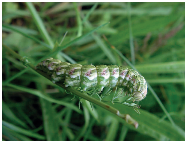
Fig. 1: Larva of Chamomile Shark ( Cucullia chamomillae )

July saw six new species recorded for the vice-county: Caloptilia honoratella at Totland, Anarsia innoxia at Shanklin, Coleophora alcyonipennella at Totland, Elachista maculicerusella at Arreton, Spilonota laricana at Totland and Ringed Border Stegania cararia at Osborne. Other notable sightings in July included Bedstraw Hawk-moth Hyles gallii at Yaverland and the second vice-county record for the following species: Argolamprotes micella , at Shanklin, Cynaeda dentalis , at Seaview and Dotted Footman Pelosia muscerda at Totland. Larva of Chamomile Shark Cucullia chamomillae (Fig. 1) was seen on Scentless Mayweed Tripleurospermum inodorum at Seaview and Cridmore, the third and fourth larva records of this species for VC10.