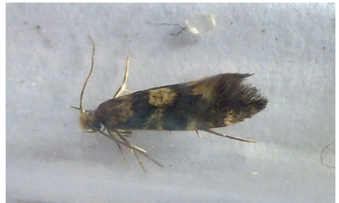
Fig. 4: Triaxomasia caprimulgella at Bonchurch.

One at Bonchurch on 25 th June 2020 originally identified as Lampronia corticella . Subsequently, re-identified as Triaxomasia caprimulgella by Mike Wall, Hampshire County Moth Recorder.