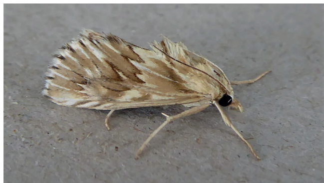
Fig. 5: Cynaeda dentalis at Springvale

One at Seaview on 22 nd July was the second VC10 record.