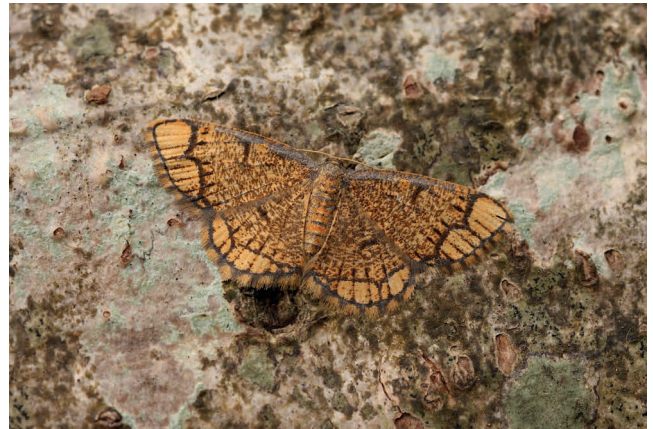
Fig. 3: Ringed Border ( Stegania cararia ) at Osborne

In addition, there were two further new vice-county records, relating to 2020 records, but not confirmed until 2021, :