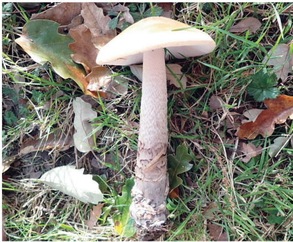
Fig.1: Snakeskin Grisette ( Amanita ceciliae ), Osborne.

Amanita ceciliae Snakeskin Grisette An Amanita with distinctive grey scaly, snakeskin-like skin markings on the stipe (Fig. 1). Osborne Estate 7 th October mo, det. EJ. Three previous Island records. First for Osborne.