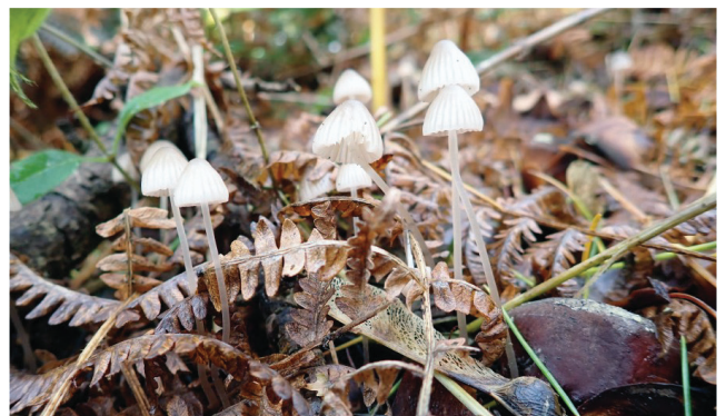
Fig. 4: Pinkedge Bonnet ( Mycena capillaripes ), Parkhurst Forest.

A small pinkish bonnet with reddish gill edges with a strong alkaline smell, in Parkhurst Forest, in needle litter beneath conifers 22 nd October CP. There have been a small handful of previous records (Fig. 4)