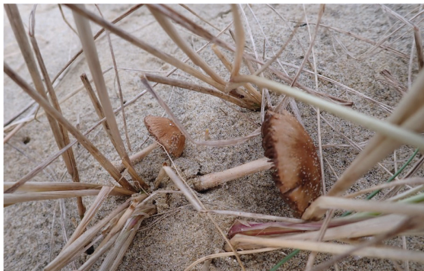
Fig.5: Psathyrella ammophila , Bembridge Point.

A sand dune brittlestem growing on Marram Grass (Fig. 5). Bembridge Point, 21 st November, CP. Previously recorded from St Helen's Duver.