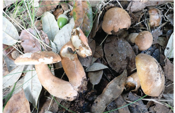
Fig.2: Chestnut Bolete ( Gyroporus castaneus ), Osborne.

A viscid brown woodwax with a distinctive annular zone on the stipe (Fig. 3). Beneath Holm Oak growing along the old railway track by Bembridge ponds, 21 st November CP conf. HFRG. This is the second Island record. It was recorded by Derek Reid from Firestone Copse in 1982 as H. dichrous .