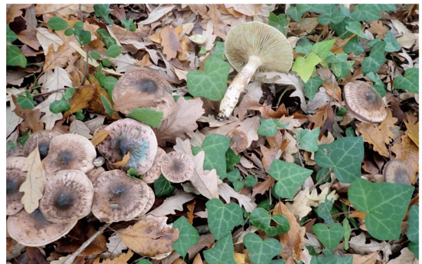
Fig. 3: Hygrophorus persoonia , Bembridge Ponds..