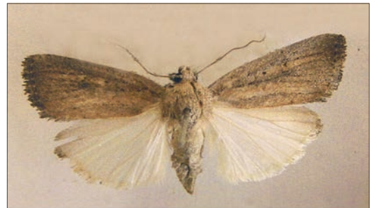
Porters Rustic Athetis .hospes