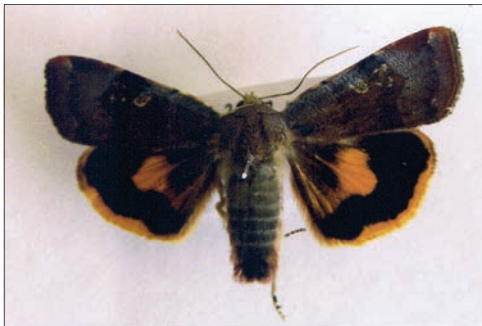
Langmaid's Yellow Underwing Noctus janthina