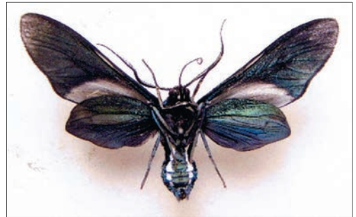
Banana Stowaway (adult)