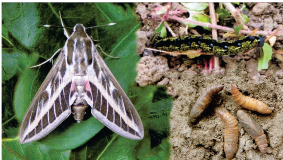
Striped Hawk Hyles livoraica