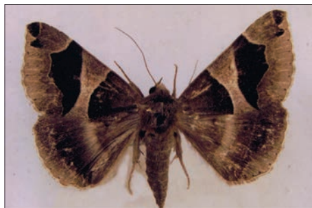
The Passenger Dysgonia