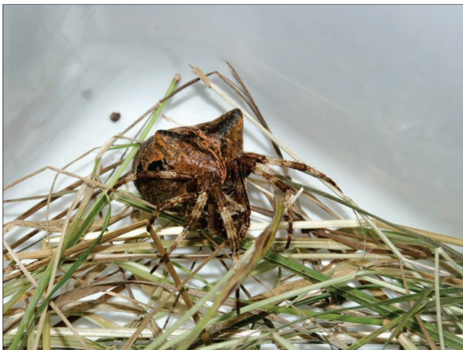
Rare Island Spider Araneus angulatus