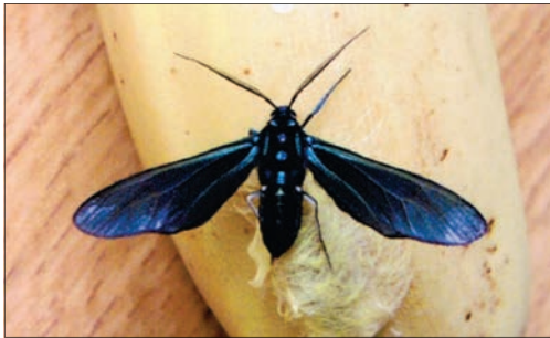
Banana Stowaway (emergence)