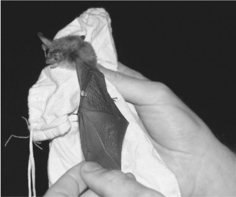
A ringed Bechstein's Bat ready to be released.