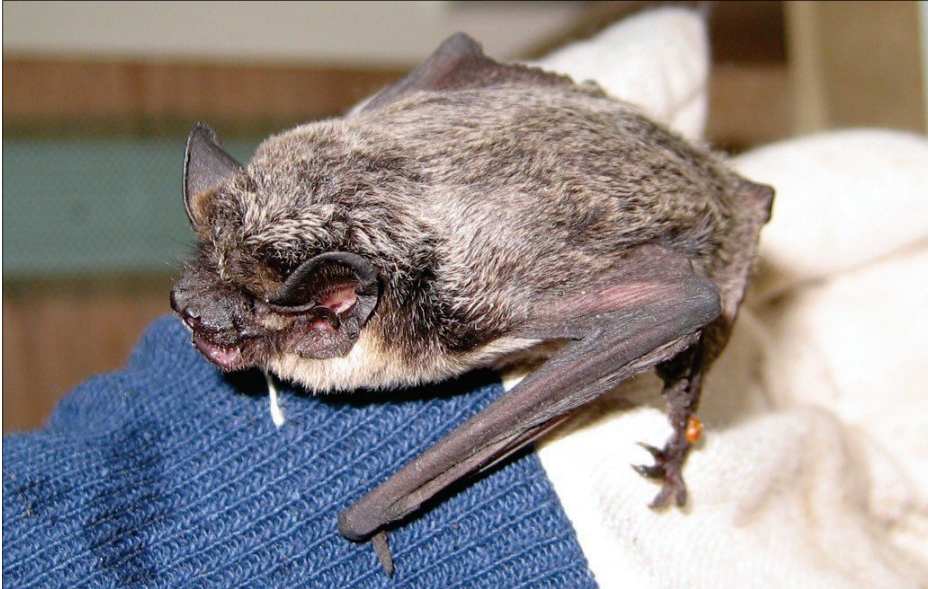
A juvenile female Parti-coloured Bat, photographed at the Bat Hospital in April, was the eleventh British record.