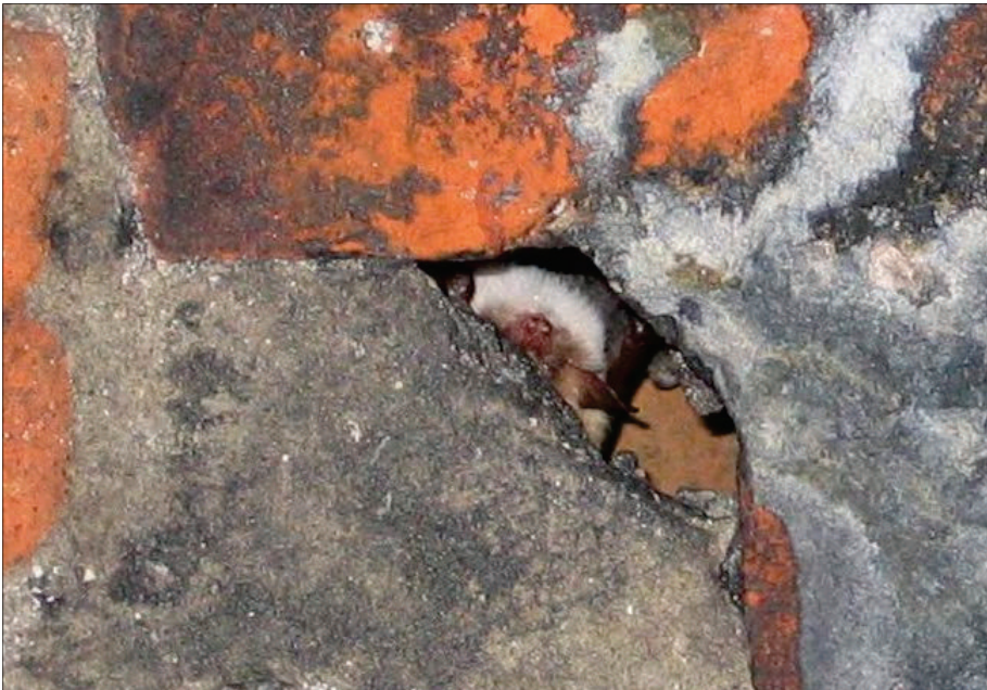
Natterer`s Bat, hibernating in Shide Tunnel