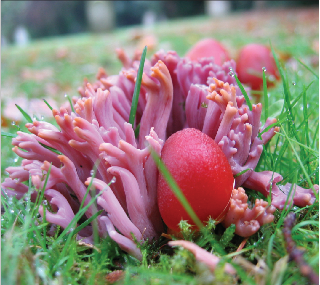
The first Island record for the rare violet coral fungus, Clavaria zollingeri , at Northwood Cemetery growing with the crimson waxcap, Hygrocybe punicea . Both are indicators of old, unimproved grassland.