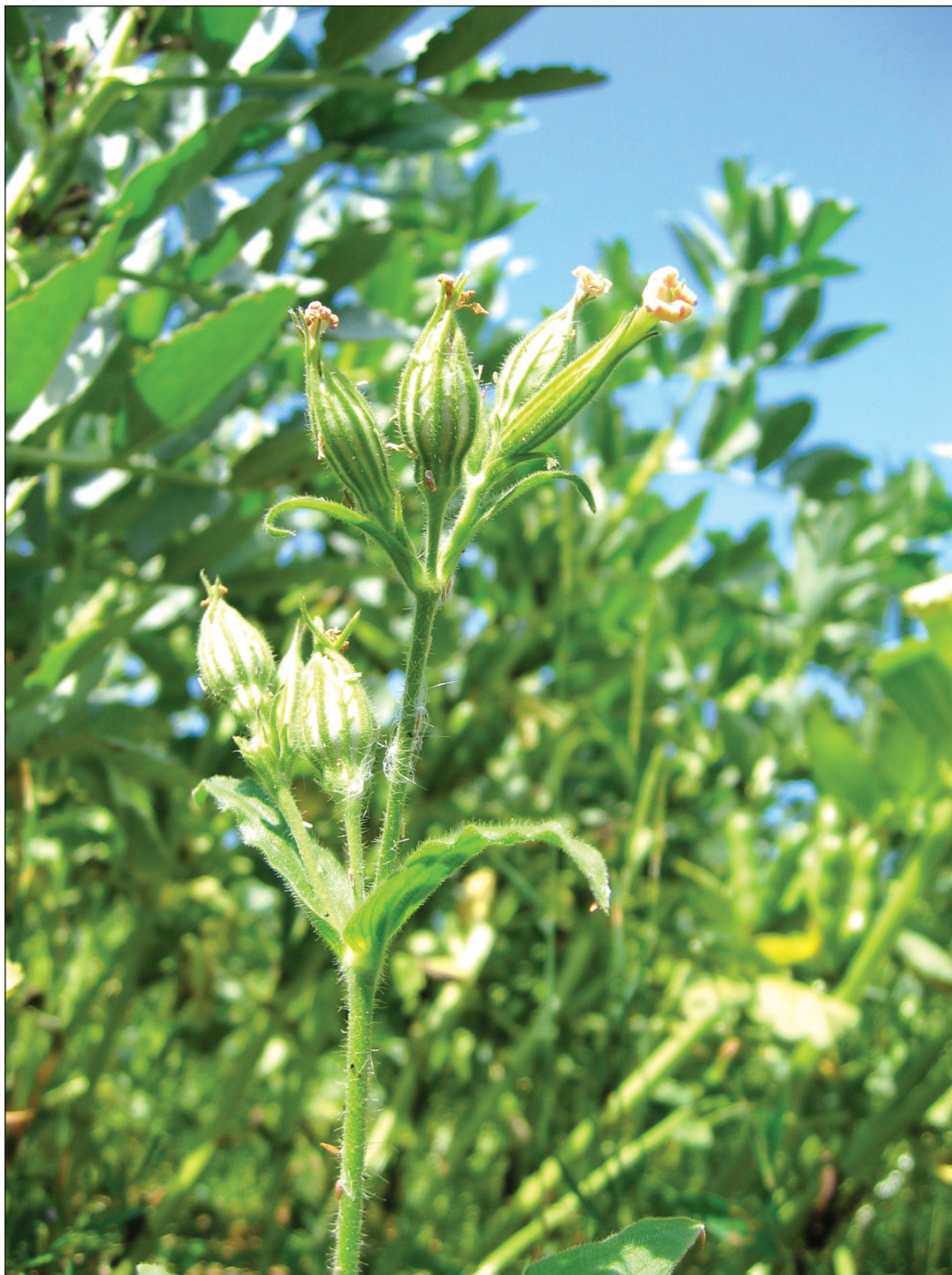
Night-flowered Catchfly ( Silene noctiflora ) in a bean crop at Thorley. The first confirmed sighting of this scarce arable plant since 1994.