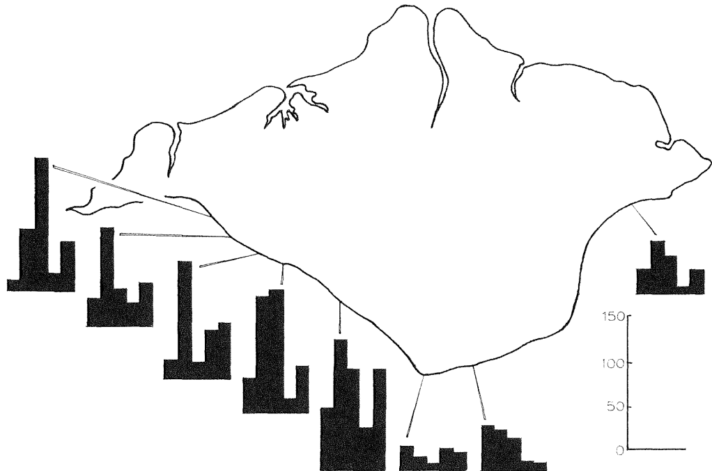
Figure 3. Recorded number of spring larval webs at eight sites for each of the years 1983 to 1987 inclusive.