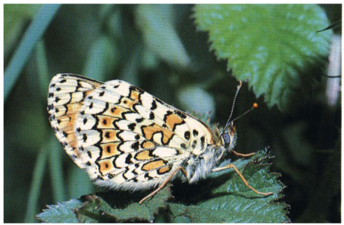
Plate 1. Life cycle of the Glanville Fritillary. a. Eggs on underside of ribwort plantain leaf. b. Larvae in silken nest in April. c. Fully grown larvae. d. Chrysalis. e, f. Adult butterfly.